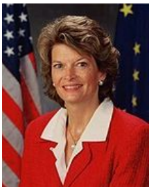
Lisa Murkowski (Alaska)