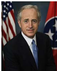
Bob Corker (Tennessee)