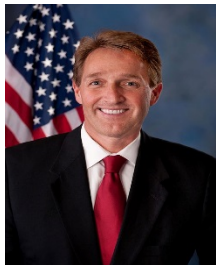
Jeff Flake (Arizona)