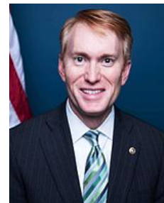
James Lankford (Oklahoma)