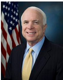
John McCain (Arizona)