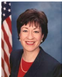
Susan Collins (Maine)