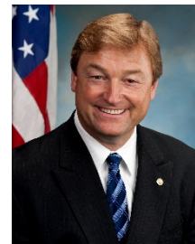
Dean Heller (Nevada)