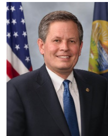
Steve Daines (Montana)