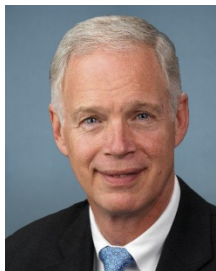
Ron Johnson (Wisconsin)