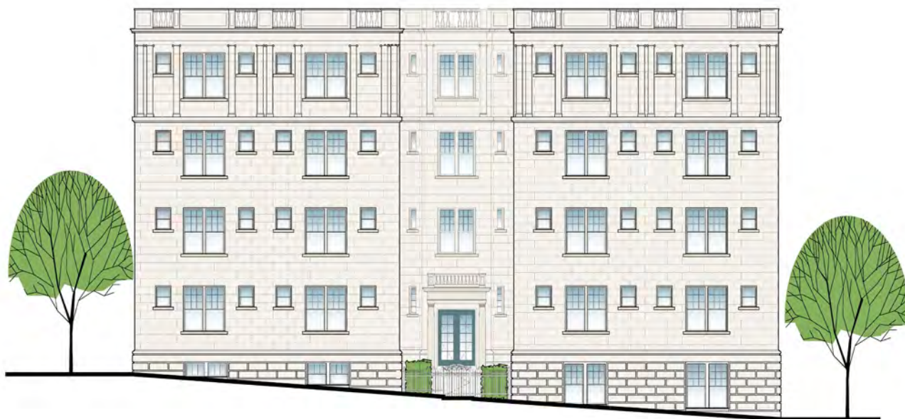
PROPOSED COURT STREET EXTERIOR ELEVATION 1/4"=1'-0"